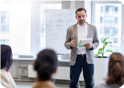
Public Health Events