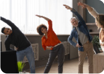
Physical Health Events