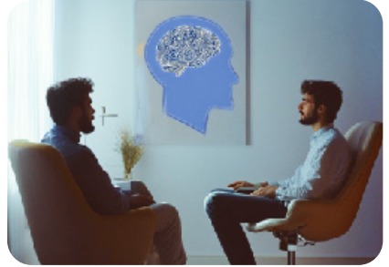
Mental Health Events