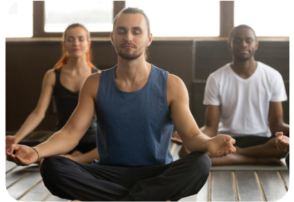
Fitness and exercise